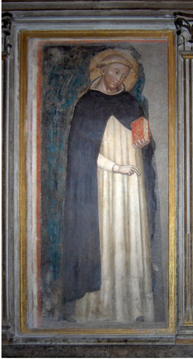
St. Dominic (1170 – 1221) founder of the Order of Preachers