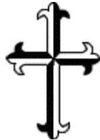
Order of Preachers (Dominican) Cross